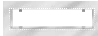
FLUSH MOUNT FRAME

Need help? We offer our customers comprehensive sales support and design assistance to help you select a system that will best meet your particular needs. To learn more, and to find a distributor near you, please contact us for prompt, professional service.